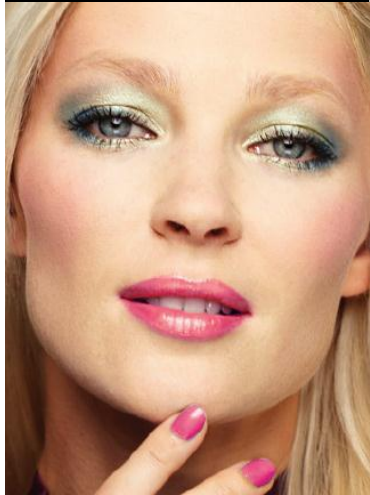
Jelly Lip Finish