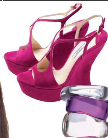
The Zen Accessories