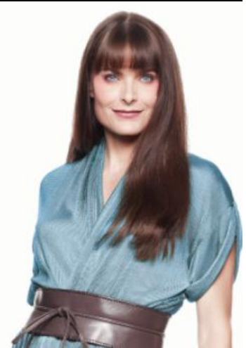
East Meets West Fashion