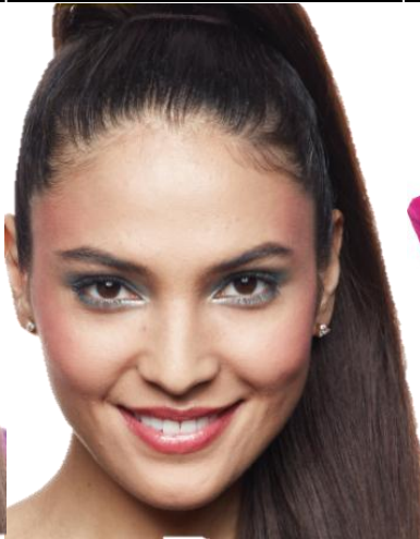
Pastel Petal Eyes